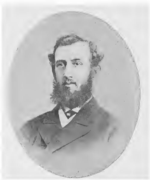
WILLIAM WINWOOD READE